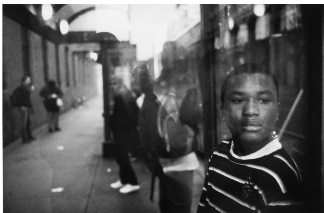
Memory City Alex Webb & Rebecca Norris Webb Robert Klein Gallery 38 Newbury St September 27 – October 31

Alex Webb and Rebecca Norris Webb Bring Signature Collaborative Style to Boston with Two Exhibitions